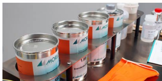
Rack for inks and auxiliary means

Optimized for the pad printing users, the new MW700 2.0 is equipped with shelves to store auxiliary items, pads, tools and much more. For cleaning jobs a paper towel rack with towel holder is also integrated.